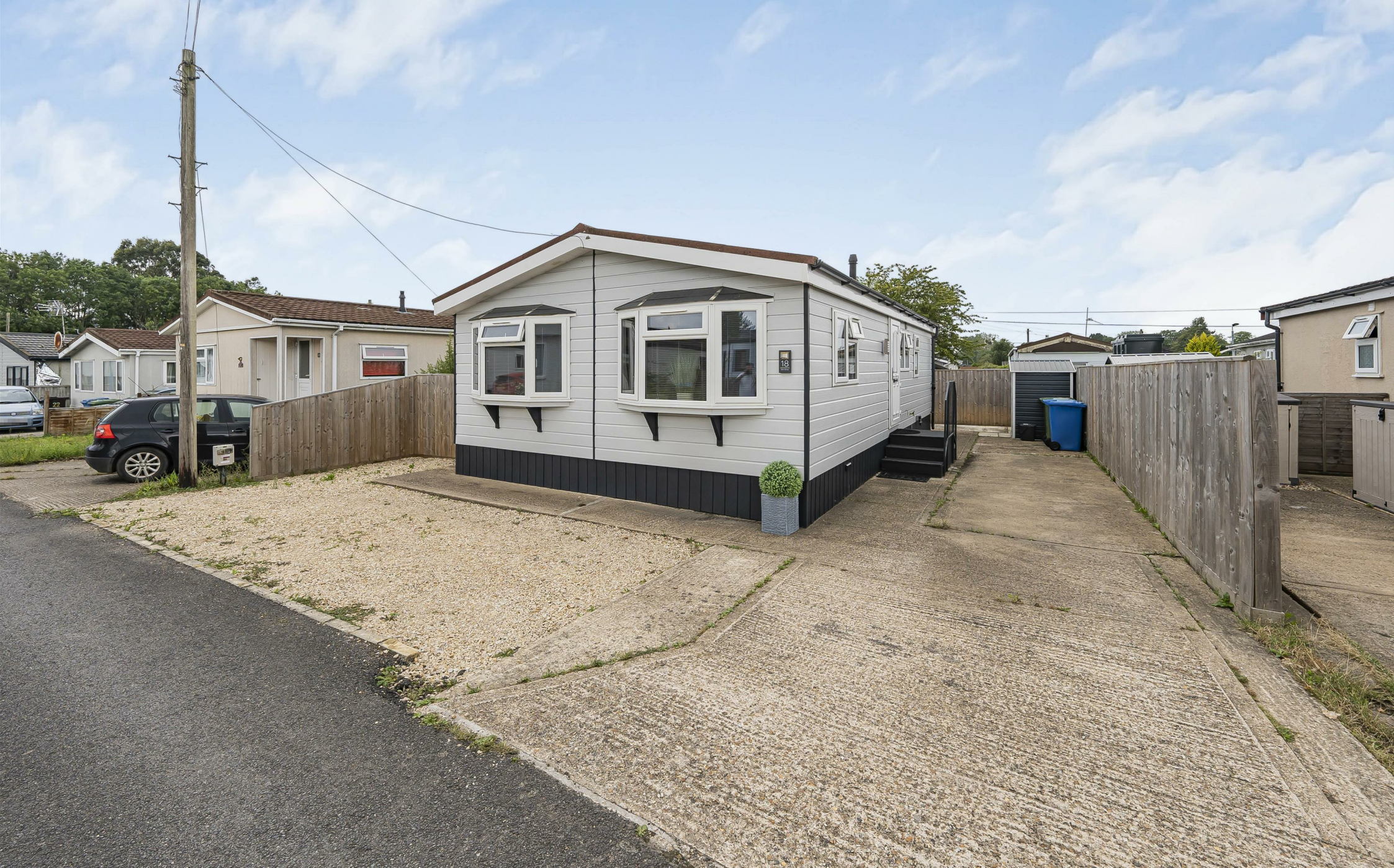
18 Elm Drive Cranbourne Hall Park, Winkfield, Windsor, Berkshire, SL4 4TT £195,000